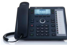
430HD IP Phone