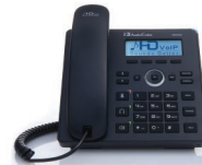
420HD IP Phone