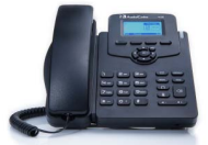
405HD IP Phone