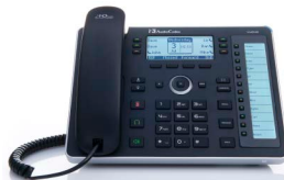
440HD IP Phone