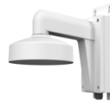
Wall mount + Junction Box