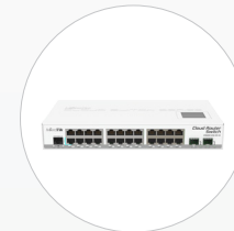
Cloud Router Switches