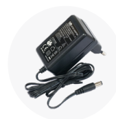
24V 0.8 A power adapter