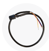
0.35 m 4pin Automotive adapter cable