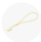
2x plastic straps