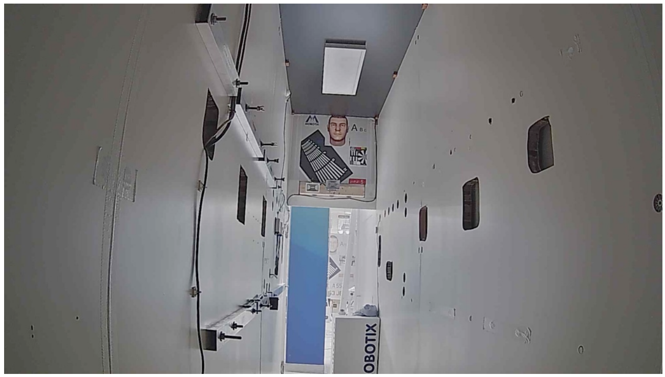
Original MOBOTIX MOVE camera image with activated WDR function: Details are easily recognizable within the dark testing room as well as at the open door with bright light entering through it. The camera automatically combines two differently lit individual images taken within a minimal time difference, thereby forming a live complete image.